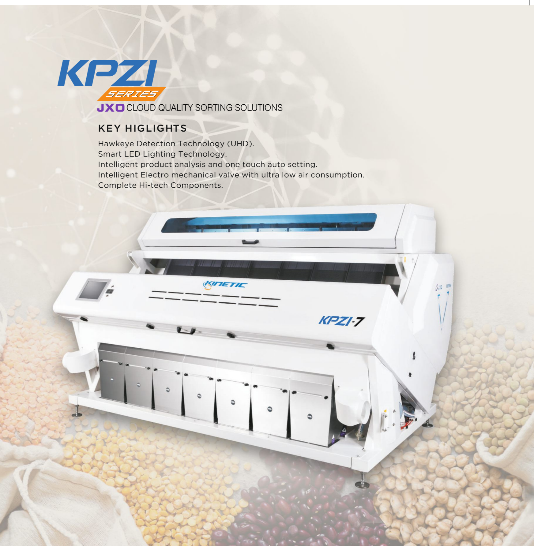
KPZI Series Intelligent Cloud Color Sorter. Three Intelligent Functions, Twele Core Technology.